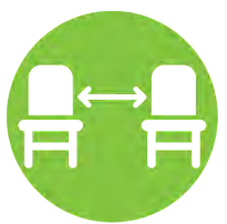
Meeting & Event Space