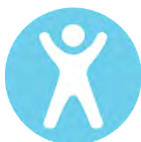
Amenities & Recreation