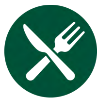
Banquet Food & Beverage