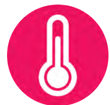
Response & Protocols